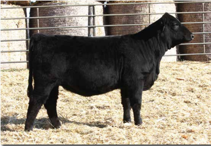
ADV MS GALILEO L3015 >> Sells as Lot 120.