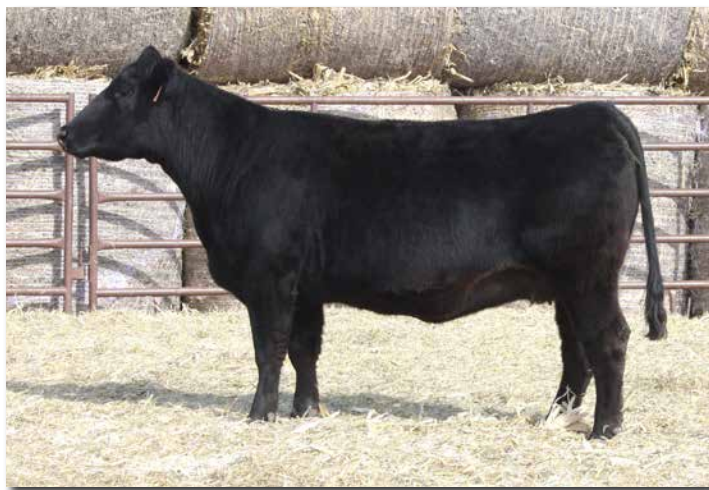
ADV MS EAGLE H0504 >> Sells as Lot 65.

PE 7/2/23 TO 9/18/23 to HOOKS ADMIRAL 33A (2716194). Confirmed safe to PE. Due 6/4/2024.