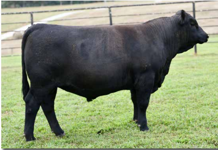
GIBBS 9446G AUTHORITY >> Sire of Lots 152-154.