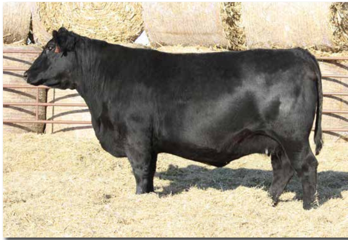
ADV MS PAYWEIGHT H0028 >> Sells as Lot 62.