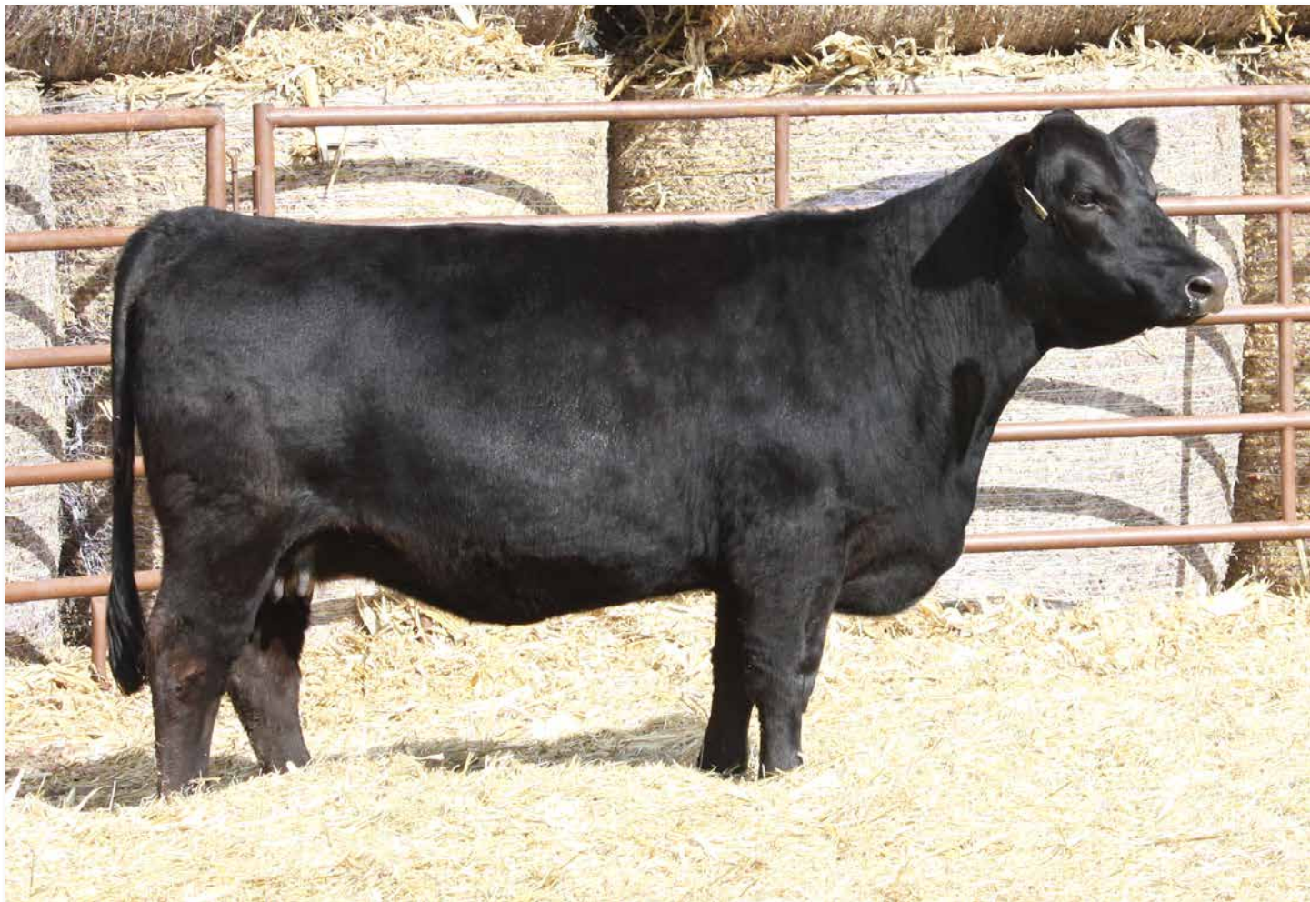
ADV MS GENESIS J1017 >> Sells as Lot 1.