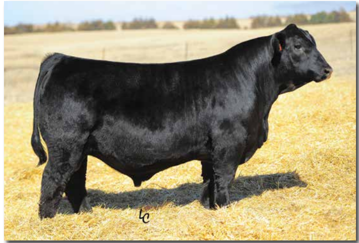
CCR WIDE RANGE 9005A >> Sire of 73-75.

Homozygous Black Homozygous Polled 5/8 SM 3/8 AN Cow ASA #3801038 H0514 BD: 9/10/2020