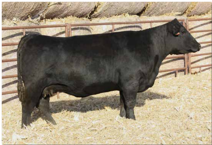
ADV MS SURE FIRE F8504 >> Sells as Lot 203.