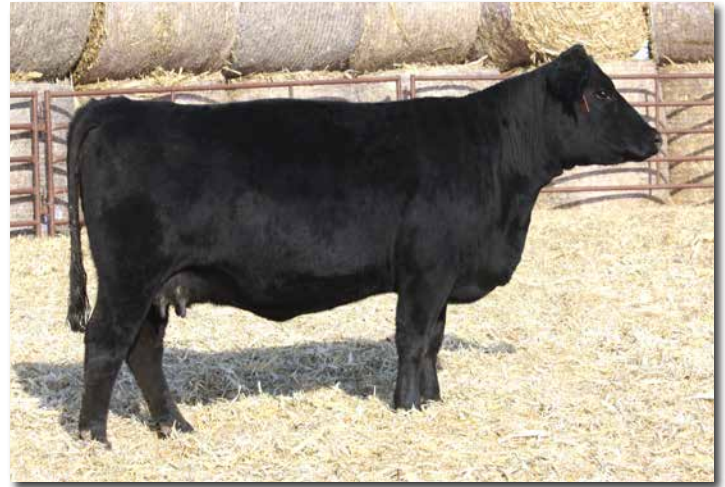
ADV MS TALON J1505 >> Sells as Lot 175.

PE 10/30-Present to REDHILL COUNTRYMAN 81J (3953944).