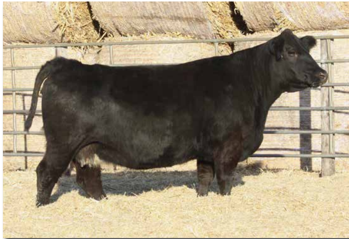
ADV MS DIPLOMAT G9031 >> Sells as Lot 85.

PE 5/23/23 TO 9/12/23 to GIBBS 9446G AUTHORITY (3716523). Confirmed safe to PE. Due 3/4/2024.