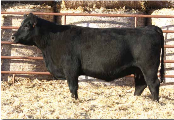
ADV MS EAGLE H0520 >> Sells as Lot 183.