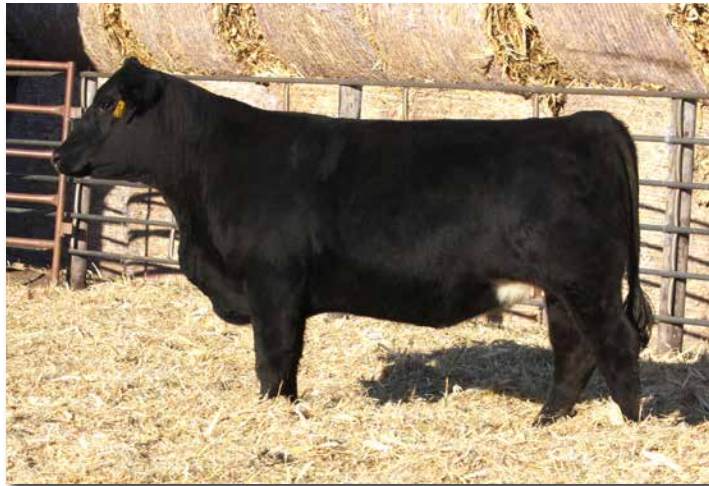
ADV MS GUARDIAN K2006 >> Sells as Lot 44.

AI bred 5/26/2023 to JC MR TALON 403G (3555669). PE 5/31/23 TO 9/12/23 to KM CLARIFIED 214 (4263232, AAA 20322913). Confirmed safe to PE. Due 4/14/2024.