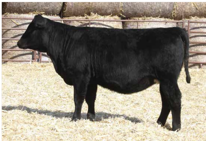
ADV MS GALILEO L3014 >> Sells as Lot 122.

Sells open. 200 API and 103 TI. Galileo out of an extremely complete JC Talon daughter. Long term genetic value built into each of these females.