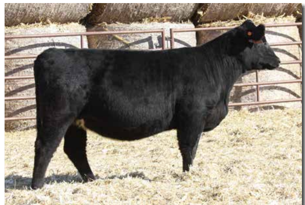
K2506 >> Daughter of Lot 101. Sells as Lot 236.