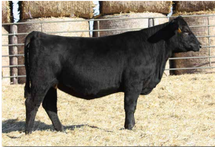
ADV MS ESSENTIAL K2020 >> Sells as Lot 51.

AI bred 5/26/2023 to HOOK'S GALILEO 210 (3563620). PE 5/31/23 TO 9/12/23 to KM CLARIFIED 214 (4263232, AAA 20322913). Confirmed safe to PE. Due 3/25/2024.