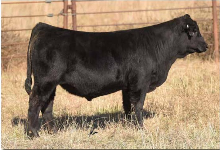
L4830 >> 2023 son of Lot 67 by Hook's Eagle 6E.