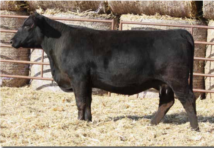
J1525 >> Daughter of Lot 160. Sells as Lot 162.