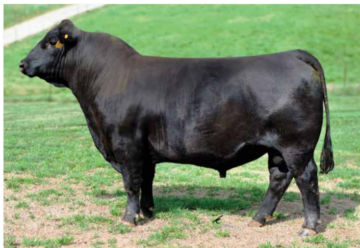
TJ DIPLOMAT 294D >> Sire of Lot 194. Maternal grandsire of Lot 195.