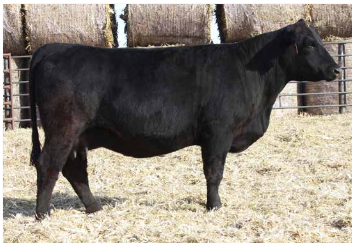
ADV MS GENESIS J1509 >> Sells as Lot 164.