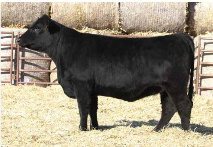
ADV MS TALON K2003 >> Sells as Lot 37.