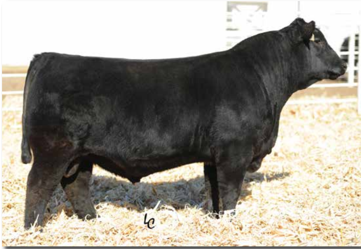
TJ Z54 >> Sire of Lot 218.