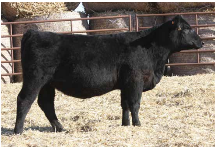
K2511 >> Daughter of Lot 100. Sells as Lot 227.