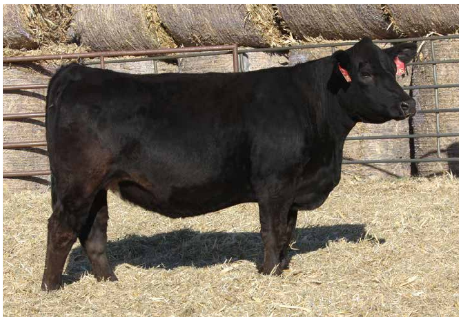
ADV MS HOMELAND K2016 >> Sells as Lot 31.

AI bred 5/26/2023 to HOOK`S GALILEO 210 (3563620). PE 5/31/23 TO 9/12/23 to KM CLARIFIED 214 (4263232, AAA 20322913). Confirmed safe to PE. Due 3/28/2024.