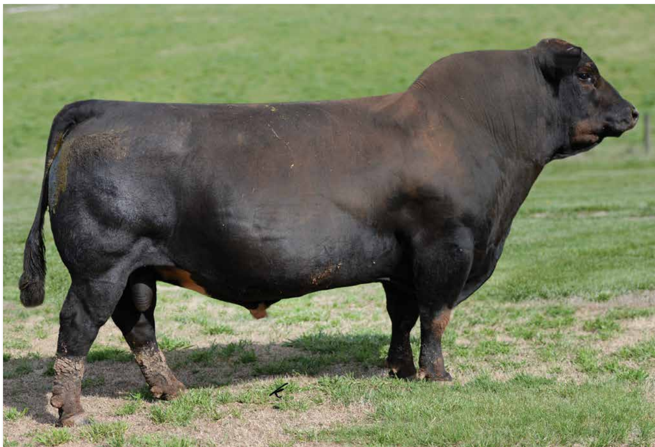
HOOKS ADMIRAL 33A >> Full brother to Lots 220, 221.