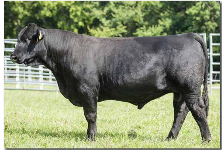
HA JUSTICE 30J >> Sire of Lots 179A, 180A.