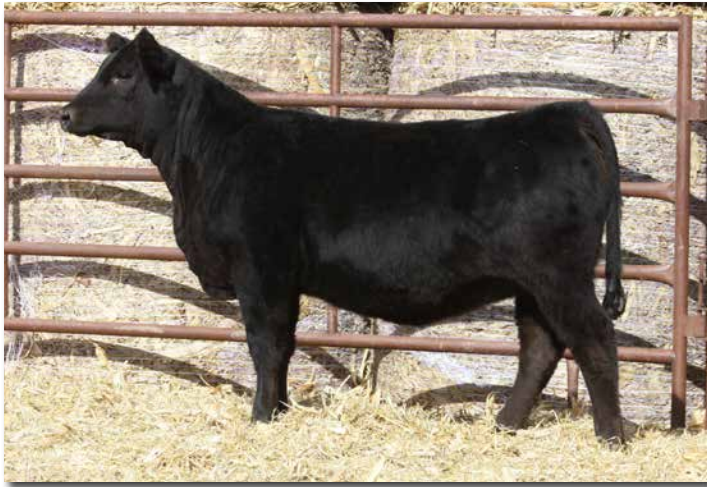
ADV MS EAGLE L3021 >> Sells as Lot 132.