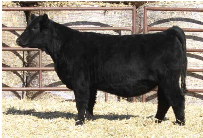
ADV MS EAGLE L3004 >> Sells as Lot 138.

L3004 will stop you in your tracks. This heifer is extremely complete in her structure yet stout enough for you to realize just how good of a bull raising dam she will be. This heifers grand dam is the great TJ 8T cow now owned by Lazy C Diamond.