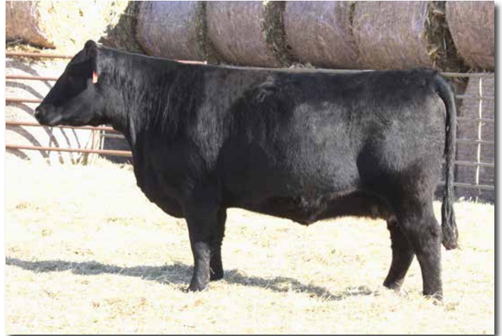
ADV MS TALON J1013 >> Sells as Lot 3.

Homozygous Black Cow ASA #3911801 Homozygous Polled J1013 5/8 SM 3/8 AN BD: 2/27/2021