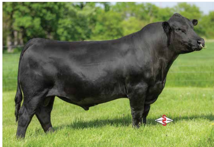
BROWN RRR EMBLEM J3547 >> Service sire of Lots 214-217.