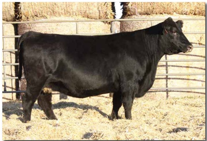
ADV MS JOURNEY G9025 >> Sells as Lot 76.

AI bred 6/12/2023 to REDHILL 672X X004 231A (2847534). PE 6/19/23 TO 9/13/23 to BROWN RRR EMBLEM J3541 (3886910). Confirmed safe to AI. Due 3/22/2024.