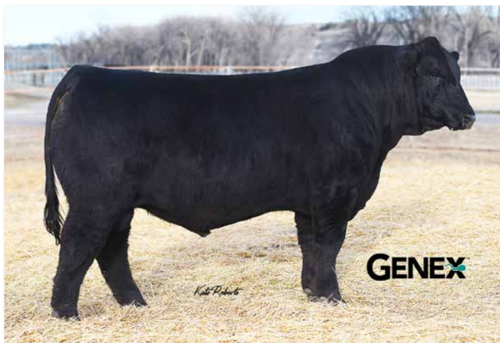
LBRMS GENESIS G69 >> Sire of Lots 161-164.