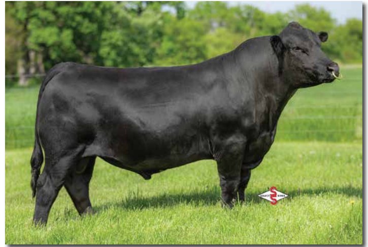
BROWN RRR EMBLEM J3541 >> Service sire of Lots 192-195.