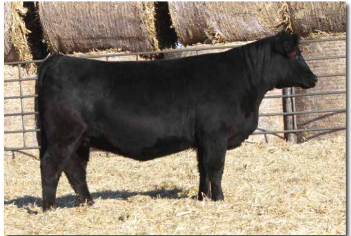
ADV MS EAGLE K2017 >> Sells as Lot 47.

K2017 is a really attractive Eagle daughter that will excel in any environment. We demonstrated the value of Galileo mated to Eagle daughters when you evaluate the open heifer calves.