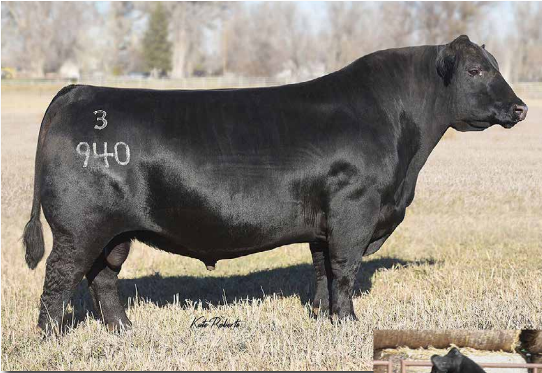
CONNELY CONFIDENCE PLUS >> Sire of Lots 236-240.