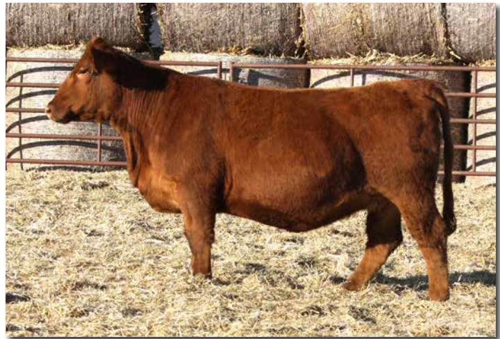
ADV MS ENERGIZE K2001 >> Sells as Lot 55.

Red Cow ASA #4154283 Polled K2001 PB AR BD: 1/8/2022