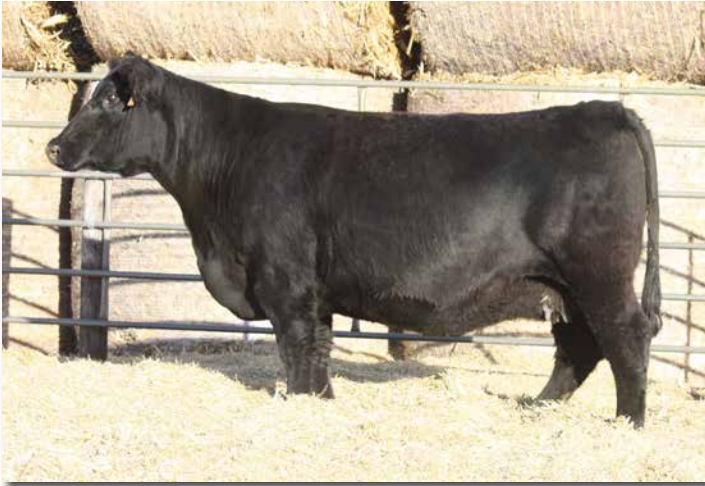
ADV MS ICONIC G9033 >> Sells as Lot 79.

PE 5/23/23 TO 9/12/23 to GIBBS 9446G AUTHORITY (3716523). Confirmed safe to PE. Due 3/29/2024.