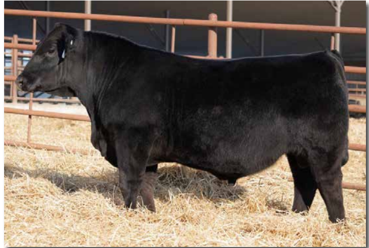
CLRS INSPIRED 0110K >> Pasture exposed sire of Lots 19-24.

Homozygous Black Homozygous Polled 5/8 SM 3/8 AN Cow ASA #3911788 J1014 BD: 2/27/2021