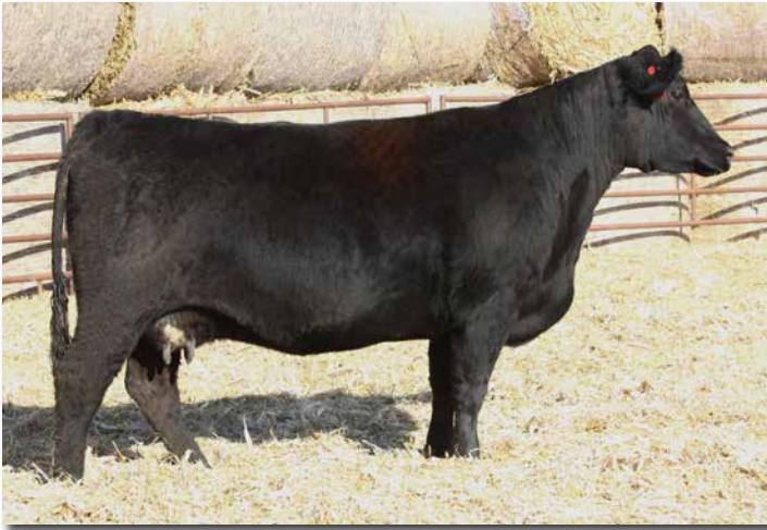
ADV MS ICONIC H0051 >> Sells as Lot 196.