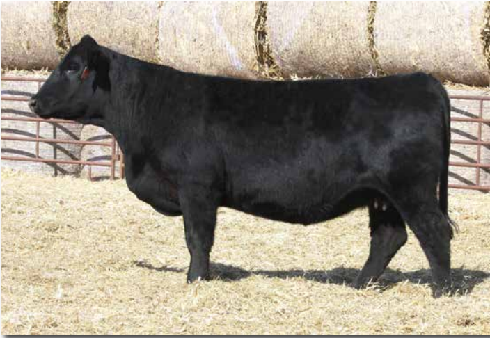
J1021 >> Daughter of Lot 99. Sells as Lot 14.