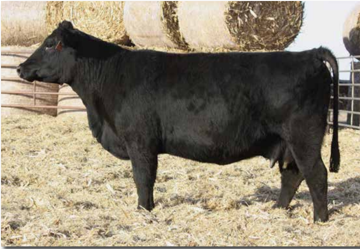
ADV MS EAGLE H0512 >> Sells as Lot 179.