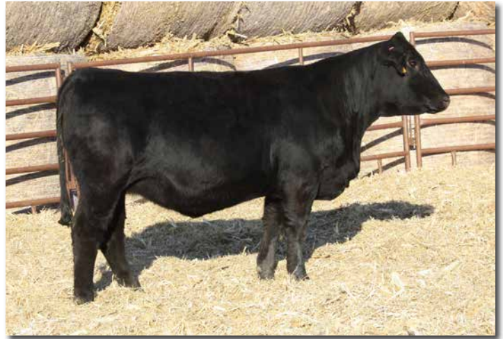
ADV MS GUARDIAN K2025 >> Sells as Lot 46.

This has been one of my favorite Guardians since birth. K2025 was the leading WW and YW heifer and it shows in her genetic profile. A 3/4 that is bred to make commercially targeted bulls.