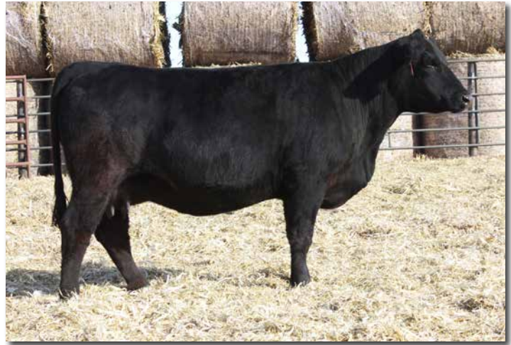
J1509 >> Daughter of Lot 160. Sells as Lot 167.