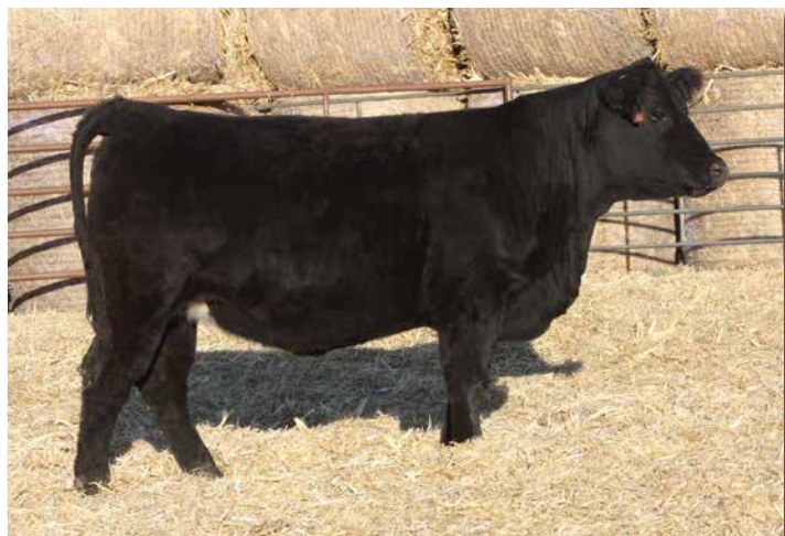
ADV MS ADMIRAL K2038 >> Sells as Lot 58.