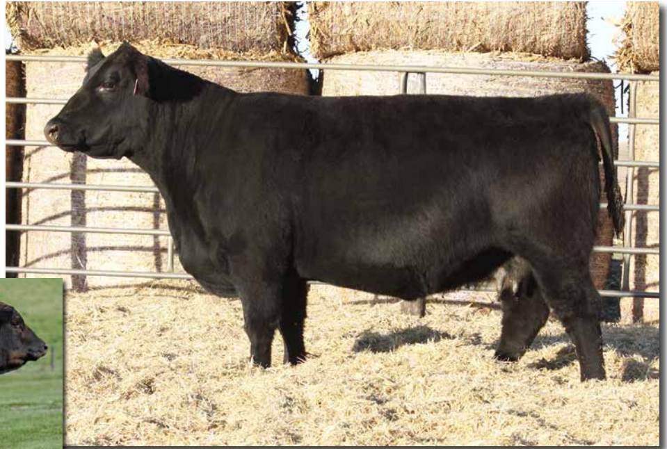
HRM MS ADMIRAL D679 >> Sells as Lot 104.