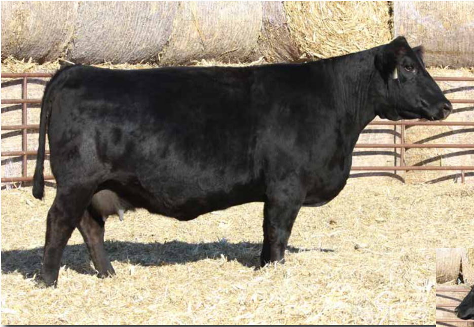
HRM MS WIDE RANCH C560 >> Sells as Lot 101.