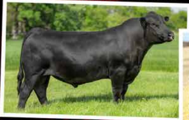
7SM139 BROWN RRR EMBLEM J3541