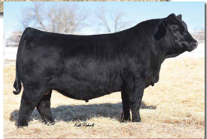
HOOK'S EAGLE 6E >> Sire of Lots 224-229.