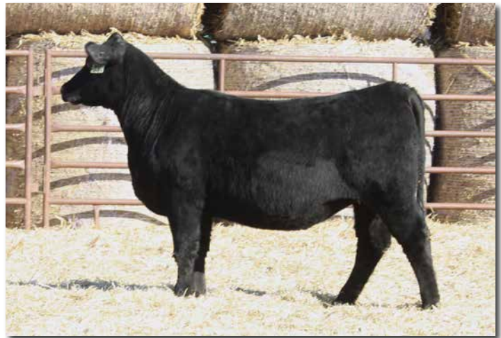
K2515 >> Daughter of Lot 160. Sells as Lot 240.