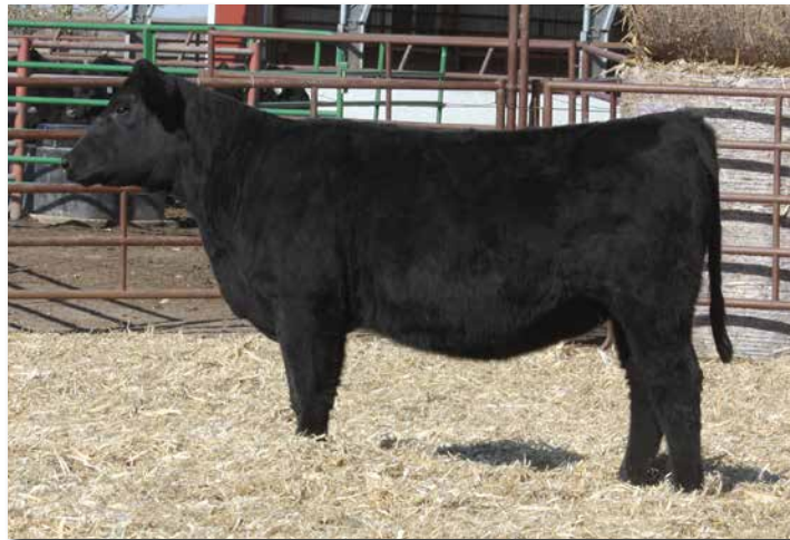
K2507 >> Daughter of Lot 100. Sells as Lot 224.