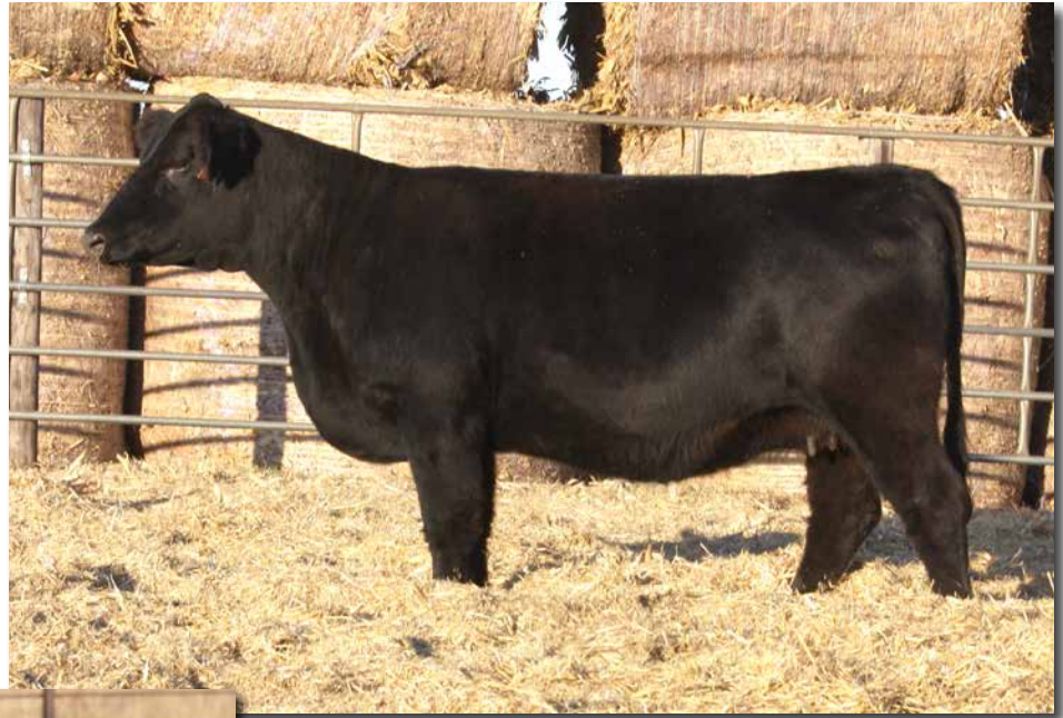
ADV MS FIRESTEEL J1040 >> Sells as Lot 19.