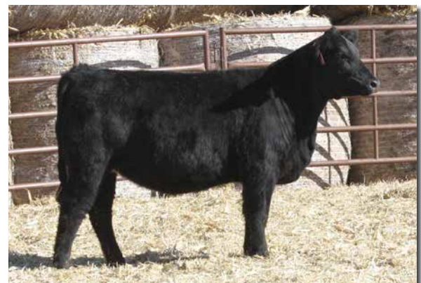
K2509 >> Daughter of Lot 101. Sells as Lot 237.