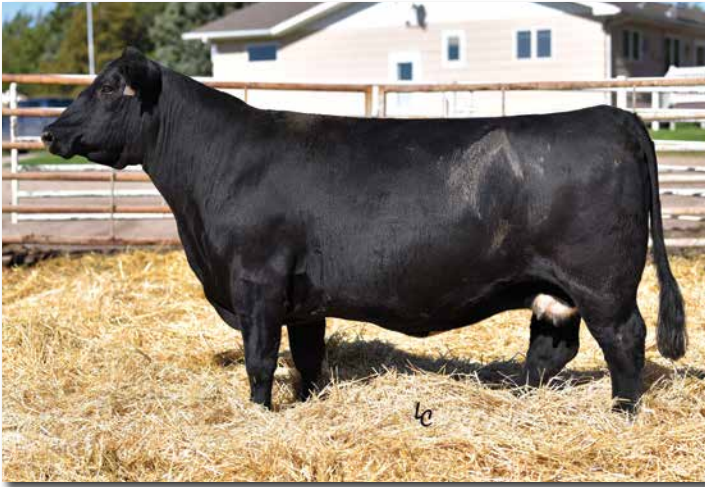
TJ 8T >> Dam of Lots 76-78.