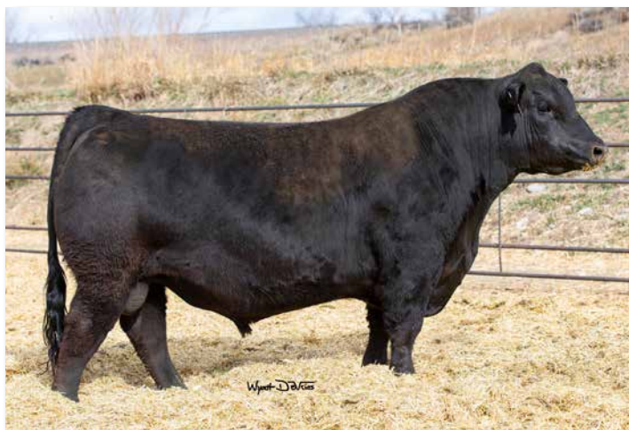
CLRS HOMELAND 327H >> Sire of Lot 181A.