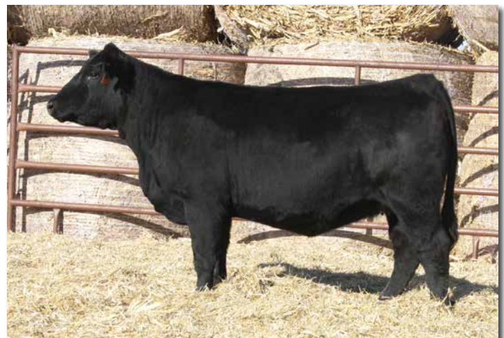
ADV MS TALON K2004 >> Sells as Lot 34.

Homozygous Black Cow ASA #4096133 Homozygous Polled K2004 5/8 SM 3/8 AN BD: 2/19/2022