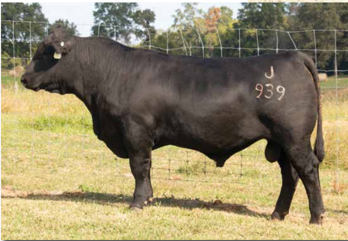
C-3 NEXT UP NS B220 J939 >> AI sire of fall bred heifers.