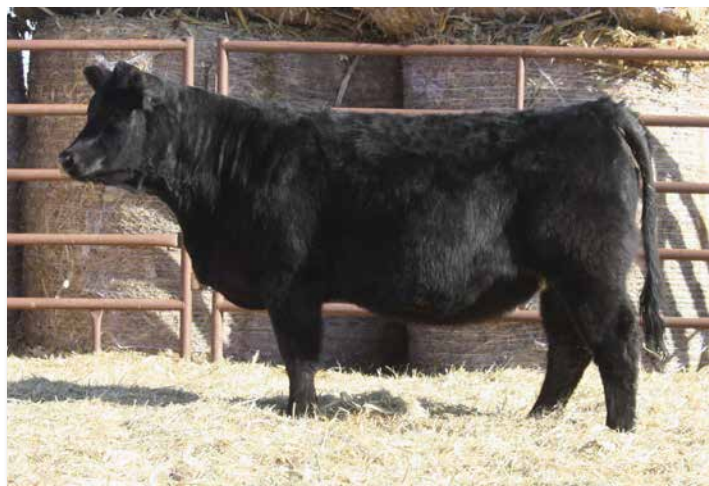
K2512 >> Daughter of Lot 100. Sells as Lot 228.