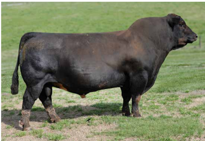
HOOKS ADMIRAL 33A >> Service sire of Lot 99.