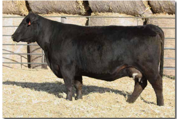
ADV MS DIPLOMAT G9512 >> Sells as Lot 197.