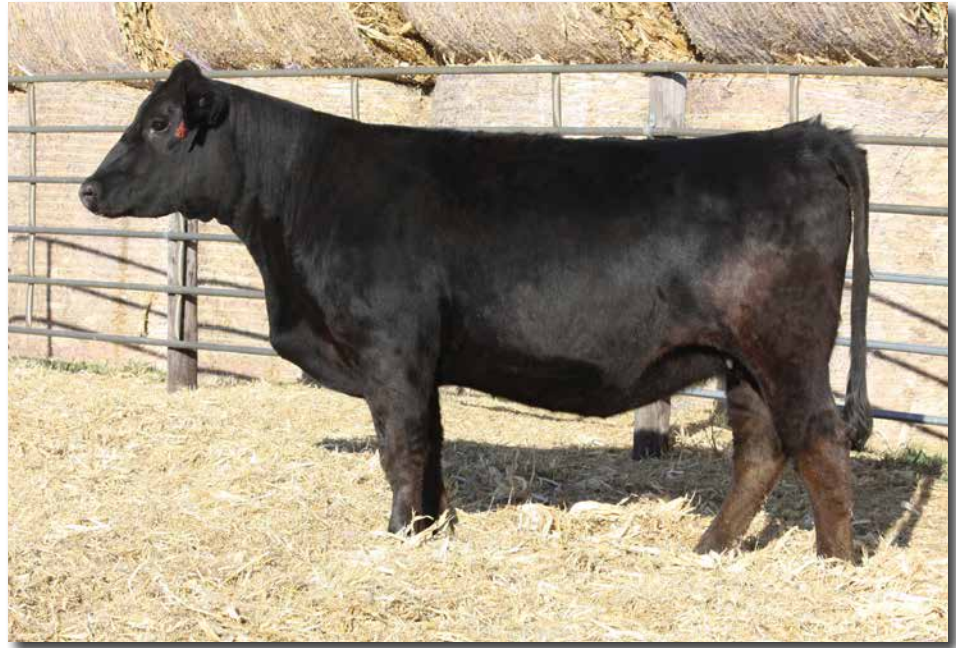
ADV MS HOMELAND K2026 >> Sells as Lot 28.

Donor alert! K2026 has a full sister that you are going to want to look up in the spring open heifer pen. This heifer is exceptional for overall design and genetic value. The mating to Galileo will be elite. We liked this heifer so much out of A384 that we ran her back the same way.