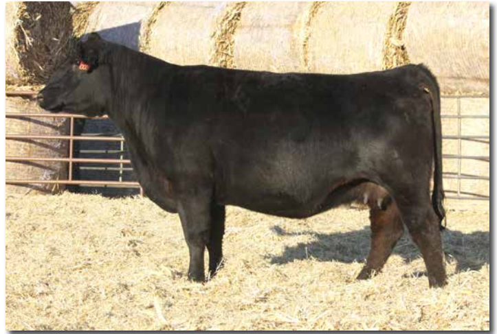
ADV MS DIPLOMAT H0023 >> Sells as Lot 67.

PE 7/2/23 TO 9/18/23 to HOOKS ADMIRAL 33A (2716194). Confirmed safe to PE. Due 4/25/2024.