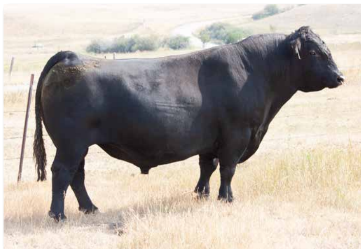
SOUTHERN FORTUNE TELLER >> Sire of Lots 185, 186.