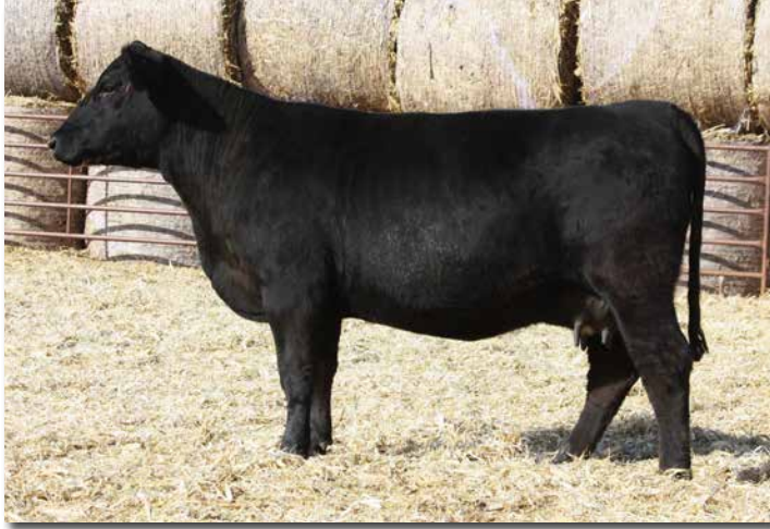
ADV MS GENESIS J1520 >> Sells as Lot 161.