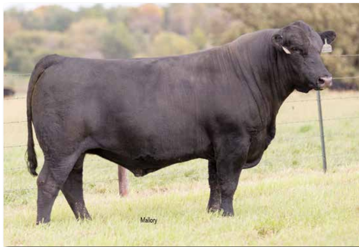
NIGHTVISION ADV 04371 >> Sire of Lot 204.