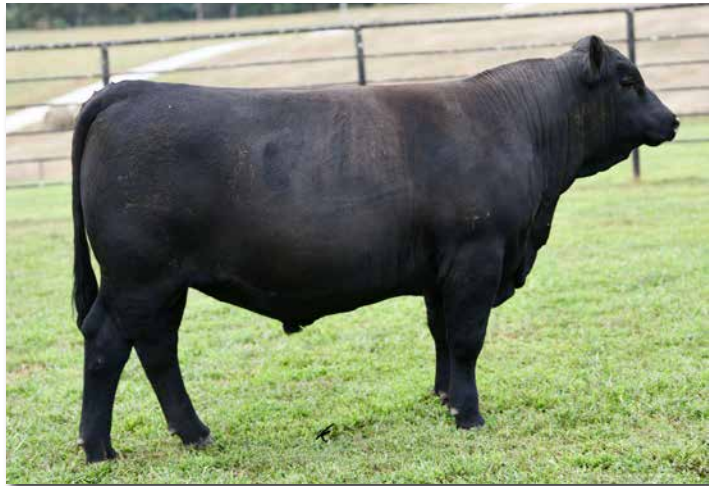
GIBBS 9446G AUTHORITY >> Service sire of Lots 115-117.