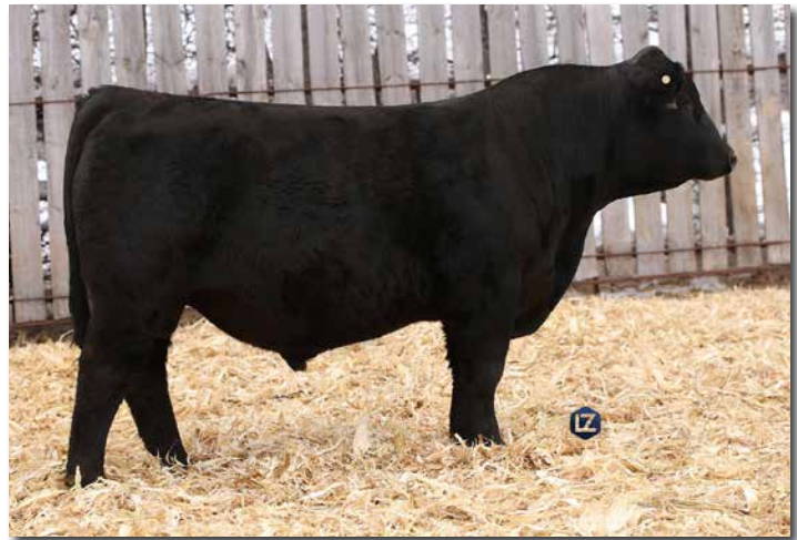
KBHR GLOBAL J138 >> Sire of Lot 183A.