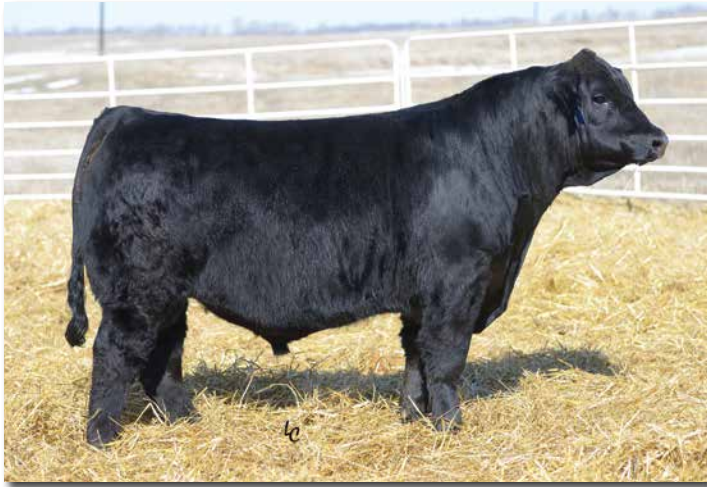
KBHR HIGH ROAD E283 >> Sire of Lot 170.