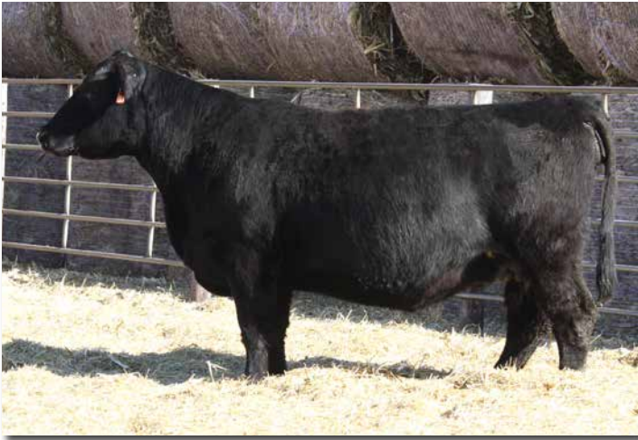
ADV MS ADMIRAL H0045 >> Sells as Lot 69.