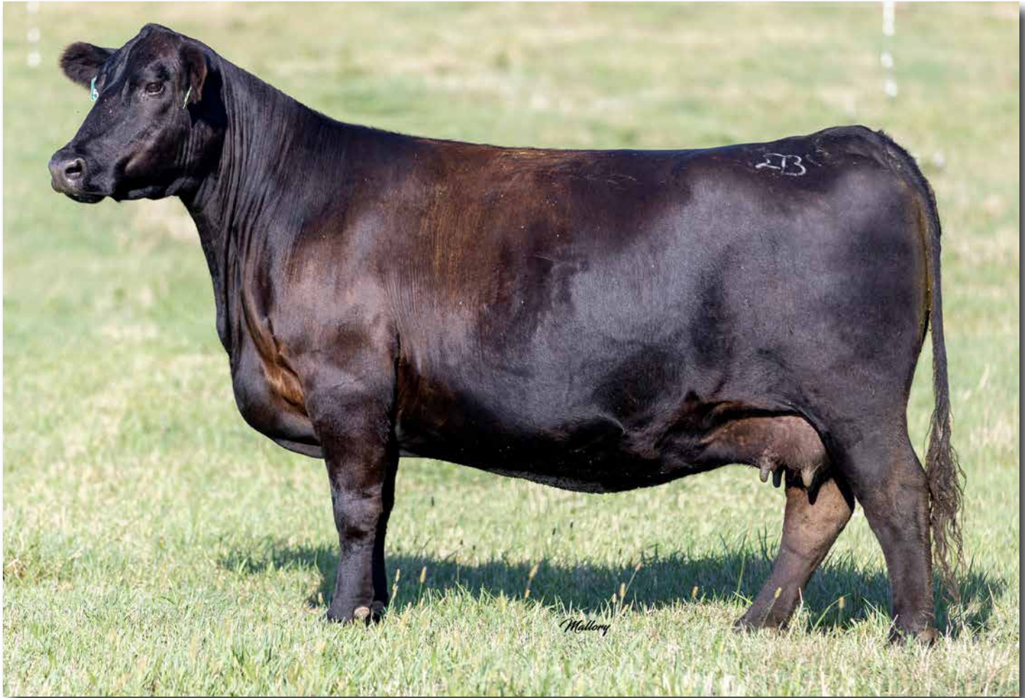
BROWN MS QUANAH 505B >> Sells as Lot 160.