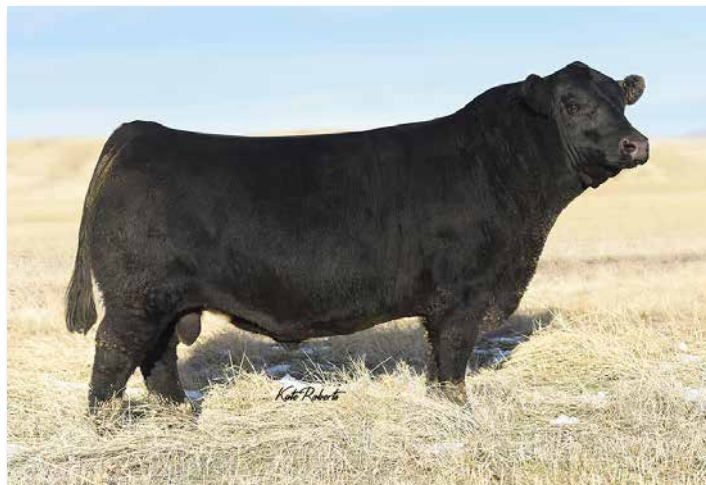
CCR BOULDER 1339A >> Sire of Lots 207, 208.