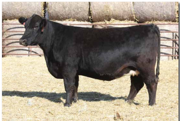
ADV MS DIPLOMAT J1044 >> Sells as Lot 24.

Homozygous Black Homozygous Polled 3/8 SM 5/8 AN Cow ASA #3911771 J1044 BD: 3/22/2021