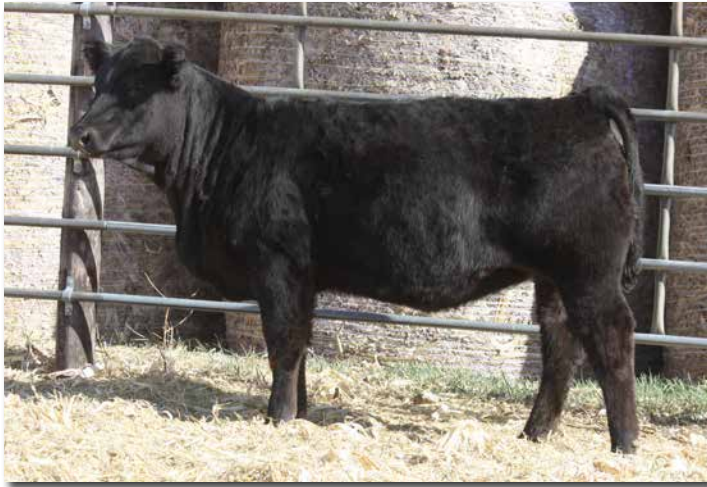
ADV MS ADMIRAL L3043 >> Sells as Lot 141.