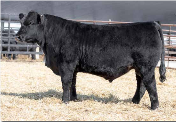
HOOK'S GALILEO 210 >> Al sire of Lots 35-37.