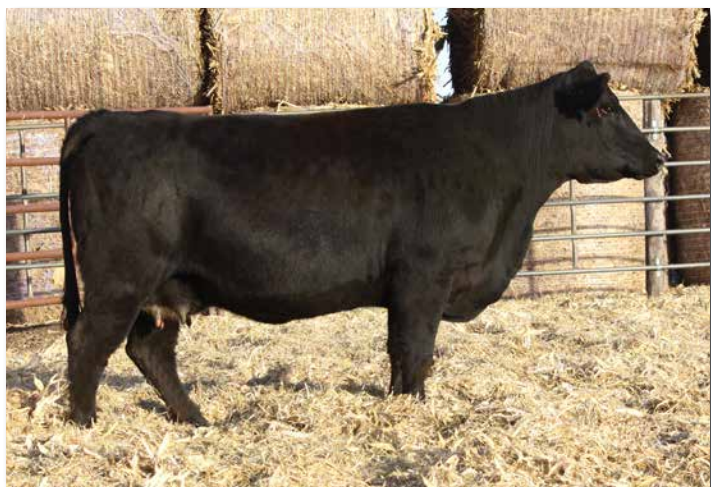
ADV MS S F TELLER H0522 >> Sells as Lot 185.