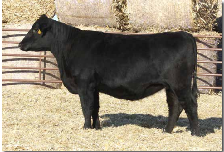
ADV MS ESSENTIAL K2030 >> Sells as Lot 54.

Homozygous Black Cow ASA #4096183 Homozygous Polled K2030 3/4 SM 1/4 AN BD: 3/10/2022