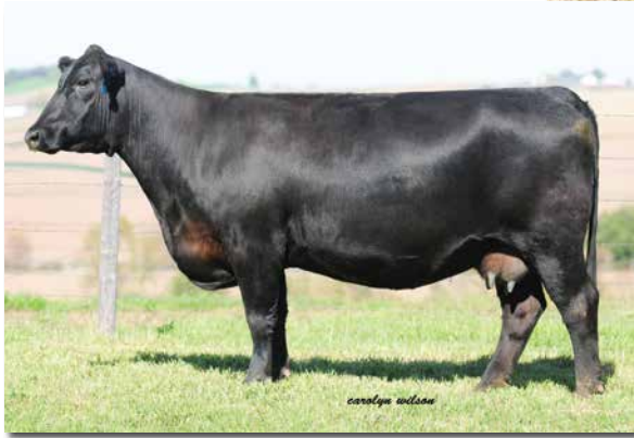
TRPH MS CATALYST A384 >> Dam of Lot 127.