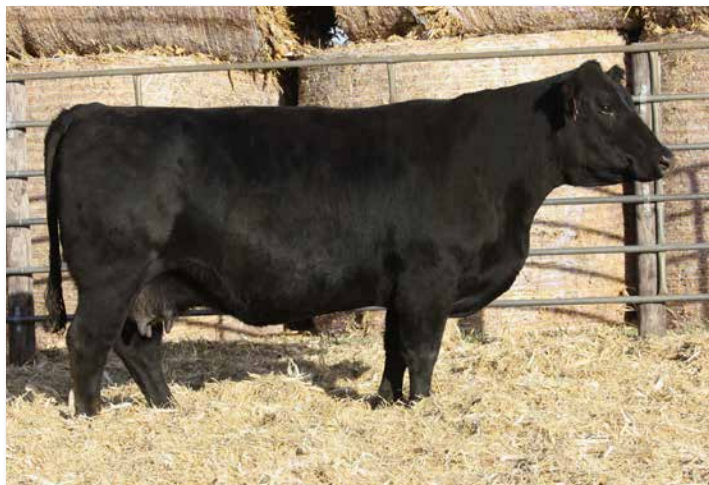
ADV MS WIDE RANGE E7502 >> Sells as Lot 216.