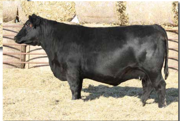
H0028 >> Daughter of Lot 101. Sells as Lot 62.