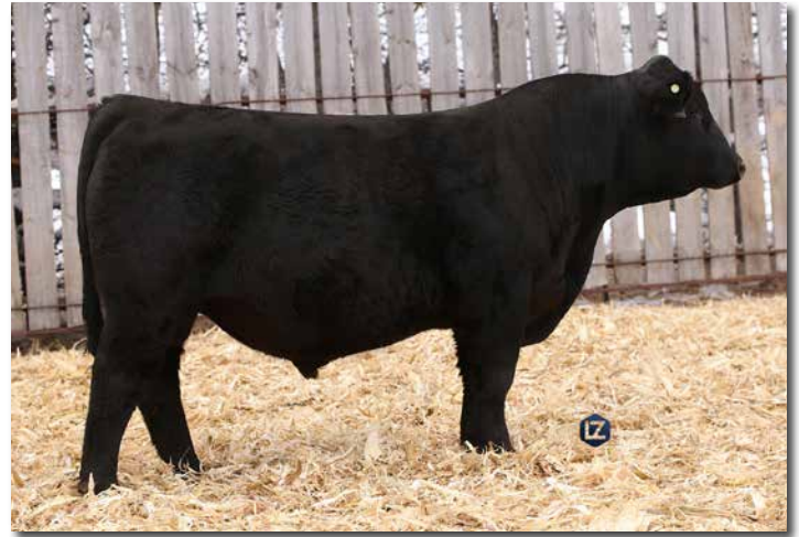
KBHR GLOBAL J138 >> Sire of Lot 215A.