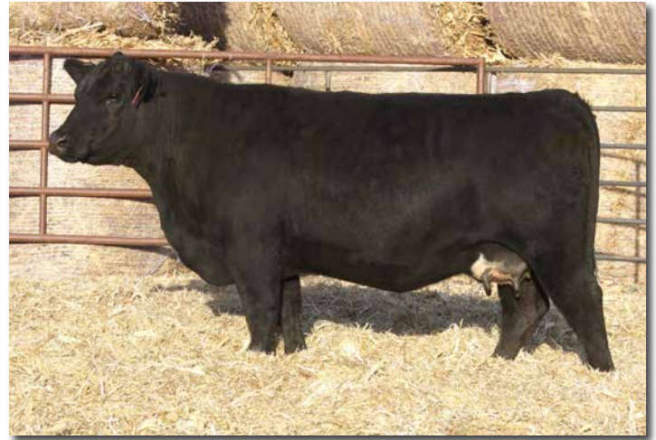
ADV MS ADMIRAL H0545 >> Sells as Lot 188.

PE 10/30-Present to REDHILL COUNTRYMAN 81J (3953944). The Southern Fortune Teller daughters were the high indexing sire group for weaning weight last year as first calf heifers. There dispositions are outstanding as well.