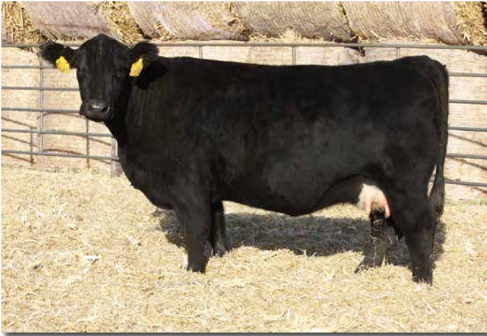
ADV MS FRONTLINE H0525 >> Sells as Lot 192.