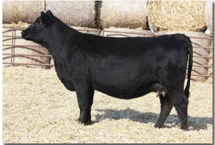
J1541 >> Daughter of Lot 99. Sells as Lot 166.