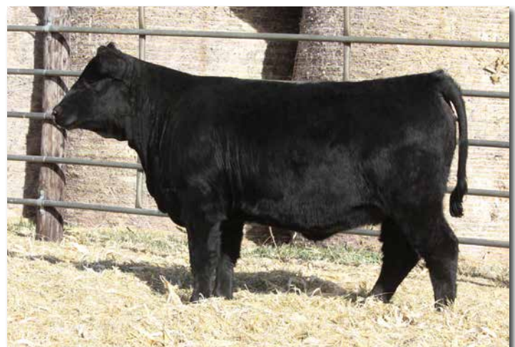
ADV MS TALON L3001 >> Sells as Lot 131.

The JC Talon daughters are so consistent. They represent highly efficient cattle, that are moderate framed, sound structured with industry leading dispositions. Look up L3001's dam, she is special.