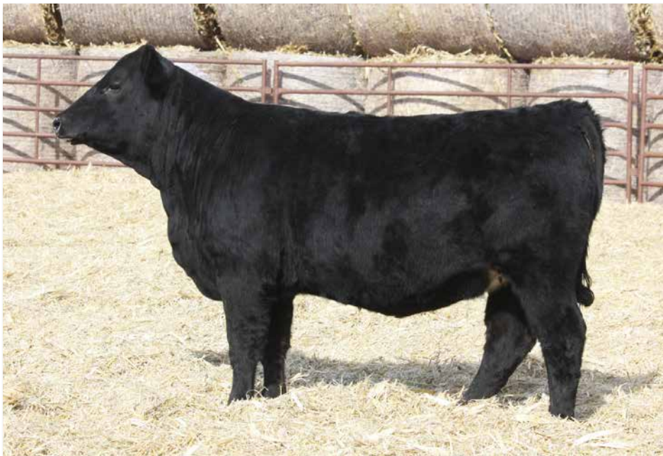
ADV MS TALON L3003 >> Sells as Lot 128.