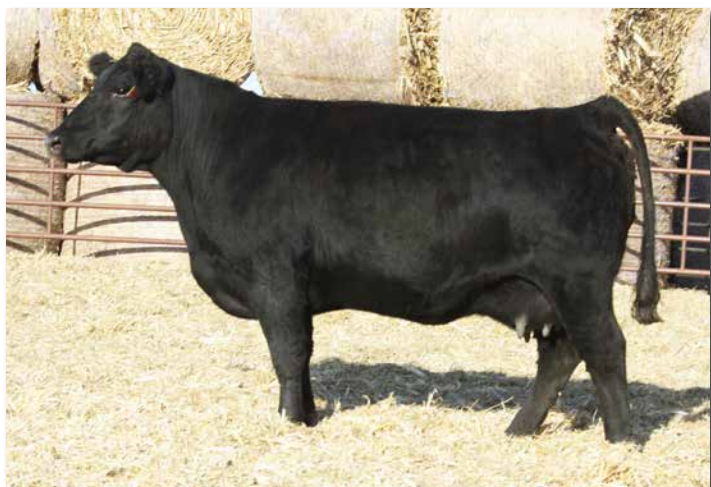
ADV MS DIPLOMAT H0515 >> Sells as Lot 194.