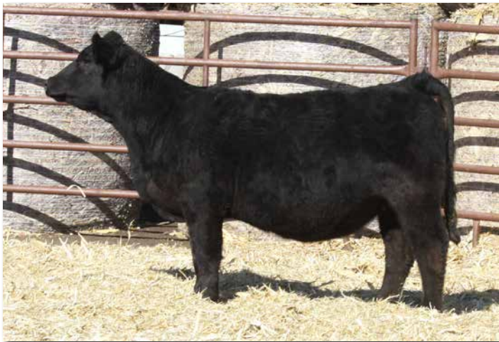
K2513 >> Daughter of Lot 100. Sells as Lot 226.