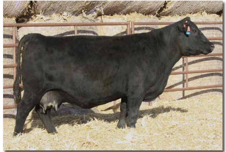
TRPH MS CROSSROADS C534 >> Sells as Lot 219.