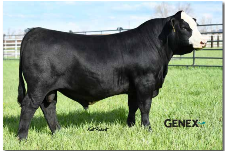
LCDR RESERVE 210J >> Sire of Lots 111A, 113A.

PE 5/23/23 TO 9/12/23 to GIBBS 9446G AUTHORITY (3716523). Confirmed safe to PE. Due 3/14/2024.