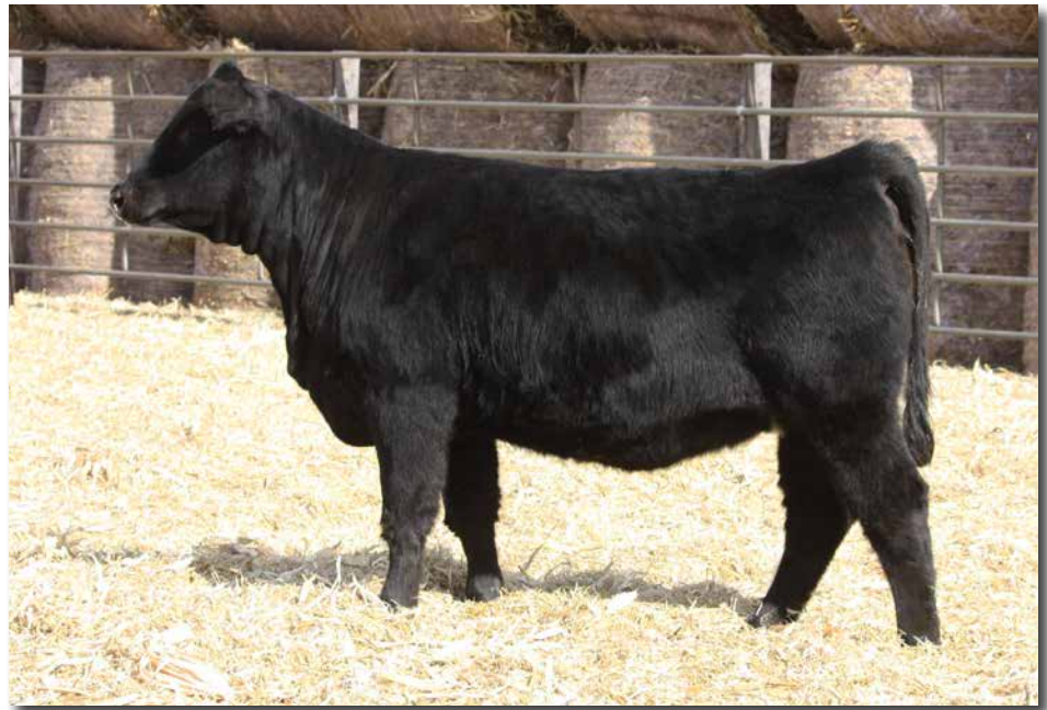
ADV MS GALILEO L3012 >> Sells as Lot 118.

One of the true breeding pieces in this group of opens. The Galileo's have been outstanding and to top it off their dispositions are outstanding.