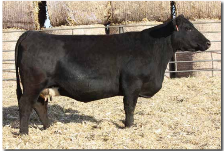
ADV MS ICONIC E7029 >> Sells as Lot 210.