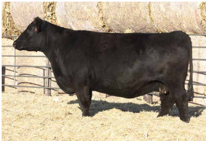
GIBBS 7011E BOL 5418C >> Sells as Lot 207.