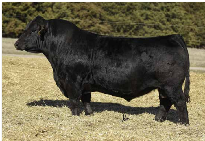
CLRS GUARDIAN 317G >> Sire of Lots 44-46.

Not hard to get these Guardian females to read as elite genomic animals. K2006 does it as a moderate framed heifer that traces back to another outstanding Admiral daughter. Take a look at the open heifers to see how Galileo worked in our cowherd, they are impressive.