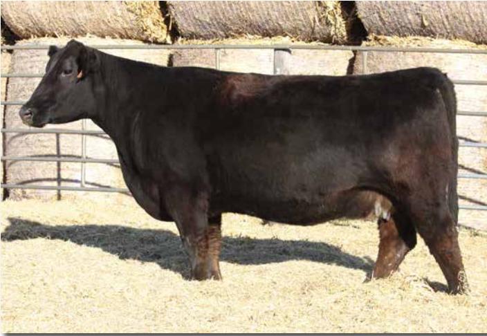
H0025 >> Daughter of Lot 160. Sells as Lot 59.