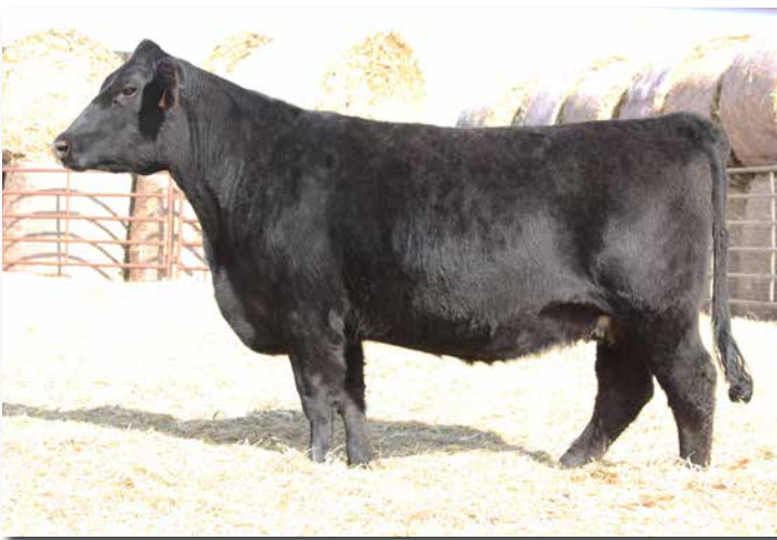
ADV MS CAPITALIST J1005 >> Sells as Lot 8.

We have had the opportunity to see the genetic value of these cows in 2 different genetic evaluations. If you know anything about the $Profit system these Capitalist females are elite for $P and $R. The resulting CLRS Homeland calf she is carrying will pay for this female.