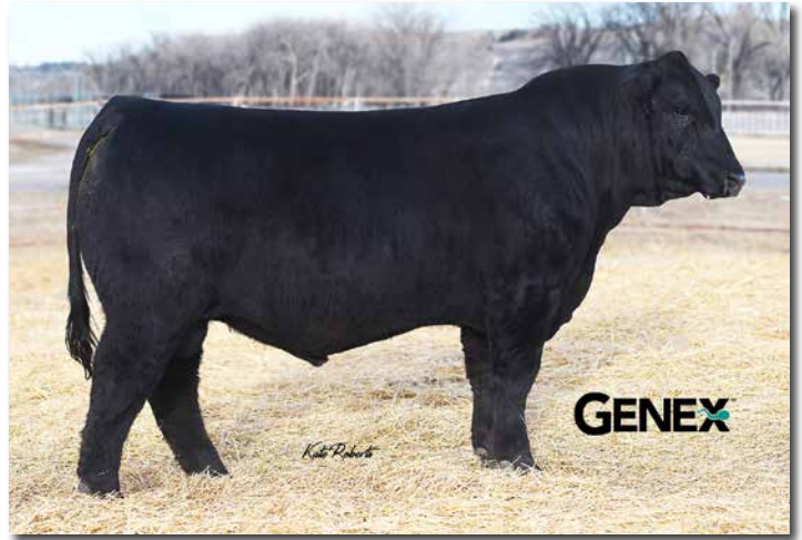
LBRS GENESIS G69 >> Sire of Lot 171.