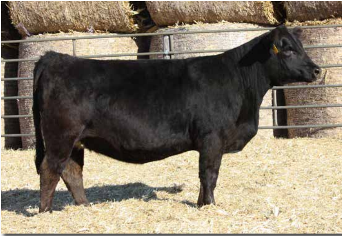
ADV MS EAGLE K2031 >> Sells as Lot 49.