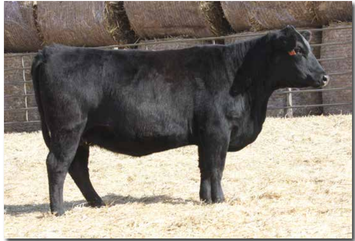
ADV MS TALON J1011 >> Sells as Lot 22.

Homozygous Black Homozygous Polled 5/8 SM 3/8 AN Cow ASA #3911811 J1011 BD: 2/24/2021