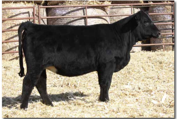
ADV MS GALILEO L3017 >> Sells as Lot 123.

Huge genetic gain awaits the new owner of L3017. You just can not find 3/4 females with this much genetic lead time built in. A384 is part of this heifers pedigree as well.