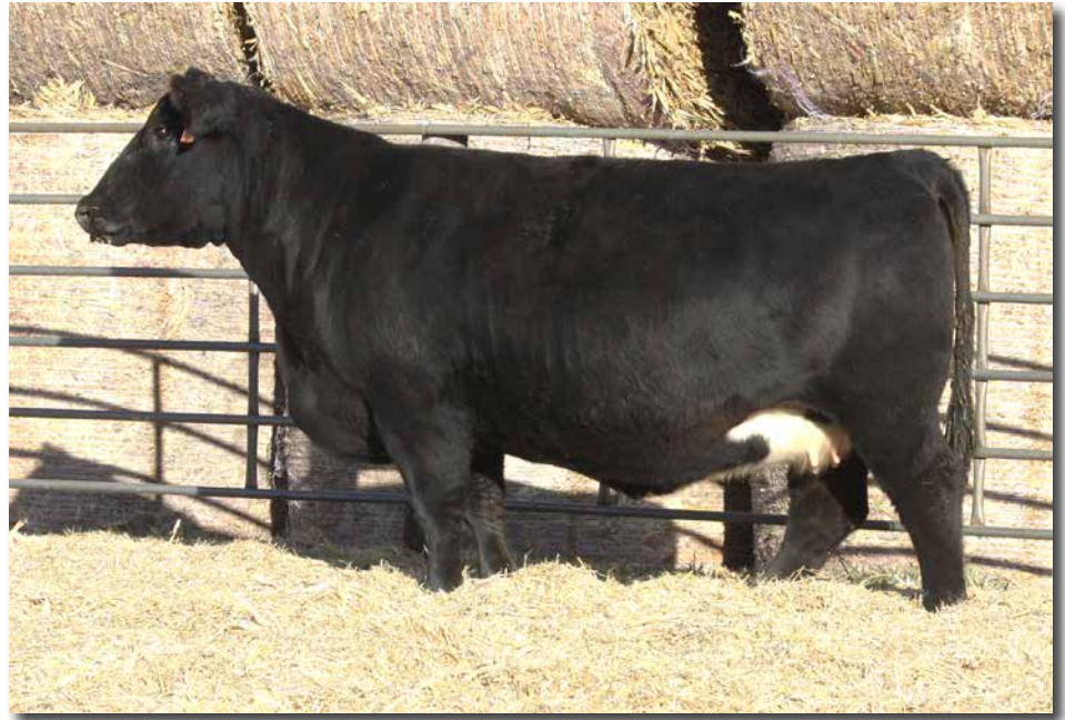
ADV MS ADMIRAL E7034 >> Sells as Lot 102.

A picture is worth a thousand words. E7034 is one of the cows that when you go check cows you always want to find. She is a creature that just puts so many things together. Massive at every angle, huge feet, absolutely beautiful udder. Her Emblem calf should be really good.