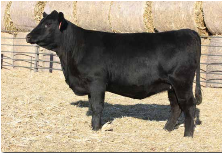
ADV MS AUTHORITY K2040 >> Sells as Lot 39.

K2008 is a JC Talon daughter that is out of a Frontline x 505B dam. That cow has an awesome Eagle sired heifer calf in the group of opens. I like this mating to KM Clarified 214 and the consistency of the cow family.