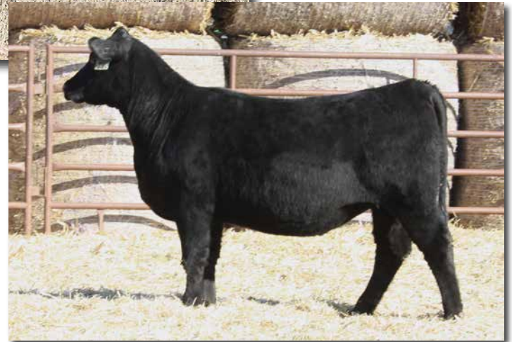
ADV MS CONFIDENCE PLUS K2515 >> Sells as Lot 40.