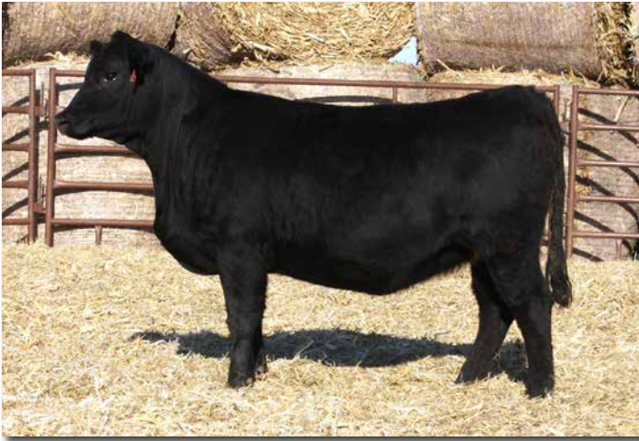
ADV MS AUTHORITY K2043 >> Sells as Lot 43.