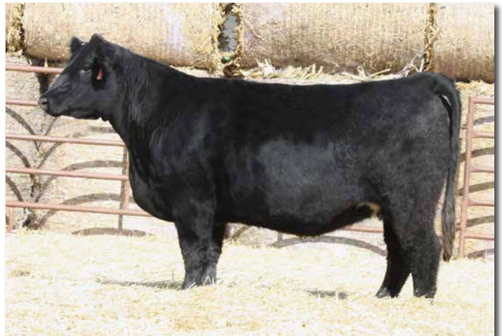
ADV MS ADMIRAL J1037 >> Sells as Lot 4.

Homozygous Black Cow ASA #3911744 Homozygous Polled J1037 5/8 SM 3/8 AN BD: 3/11/2021