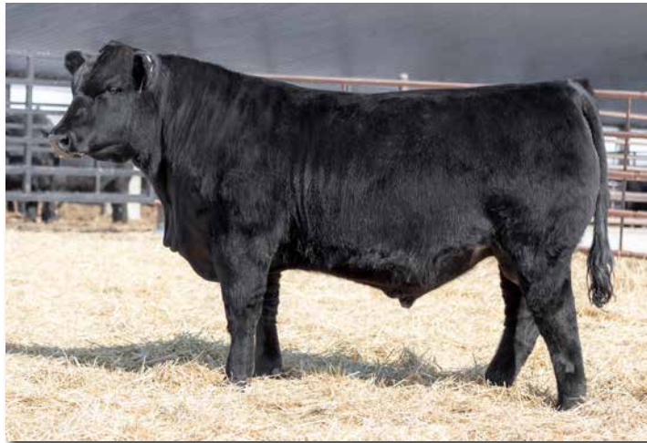
HOOK'S GALILEO 210G >> Sire of Lots 118-126.

Sells open. Not sure where to start on this heifer calf. I think this one has the opportunity to make someone look really smart. 193 API and 113 TI with absolutely no holes in her genetic profile. Backed by one of the most consistent cow family's represented in the dispersal and she is killer looking. I believe this one will make your customers a lot of money.