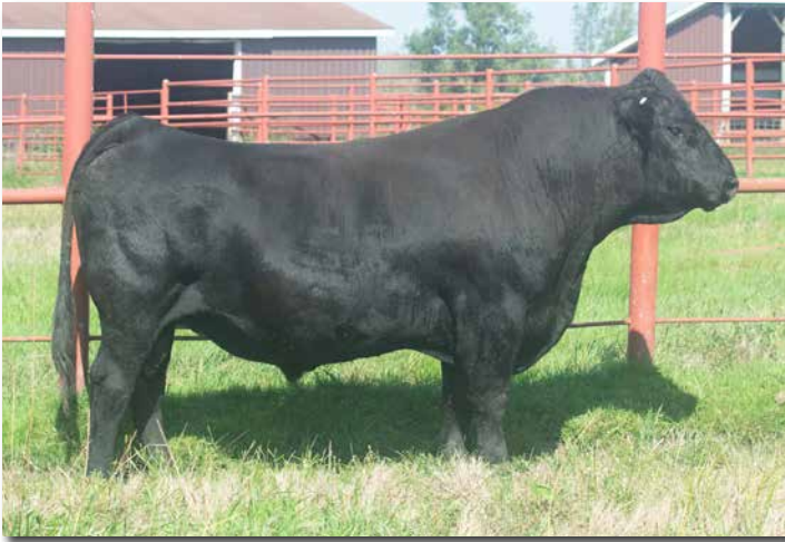
JC MR TALON 403G >> Sire of Lots 209A, 210A.