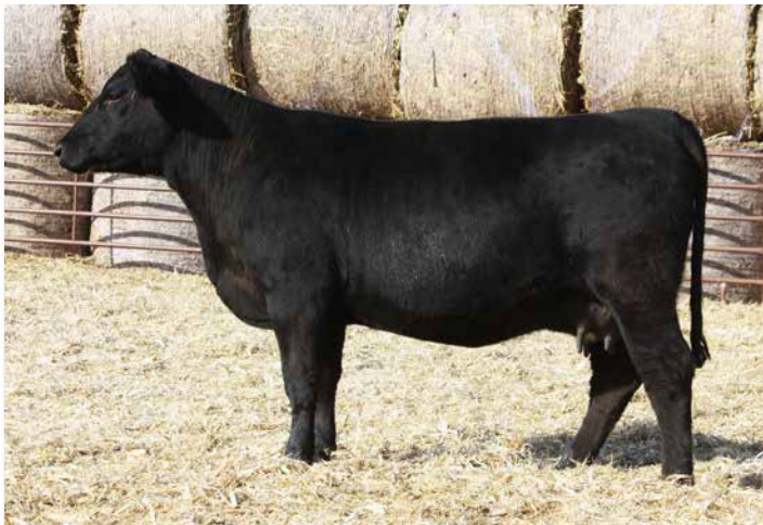
J1520 >> Daughter of Lot 160. Sells as Lot 161.