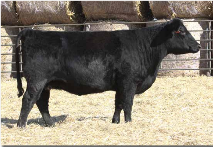
ADV MS CAPITALIST J1010 >> Sells as Lot 5.