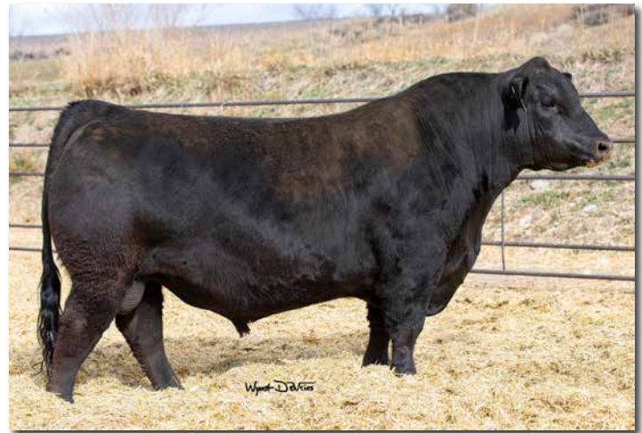
CLRS HOMELAND 327H >> Sire of Lots 28-33.

Homozygous Black Cow ASA #4096198 Homozygous Polled K2033 5/8 SM 3/8 AN BD: 3/12/2022