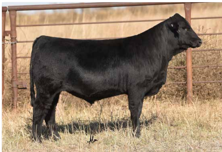
L3574 >> 2023 son of Lot 1 by Hook's Galileo 210G who boasts a $API of 207 and $TI of 117.