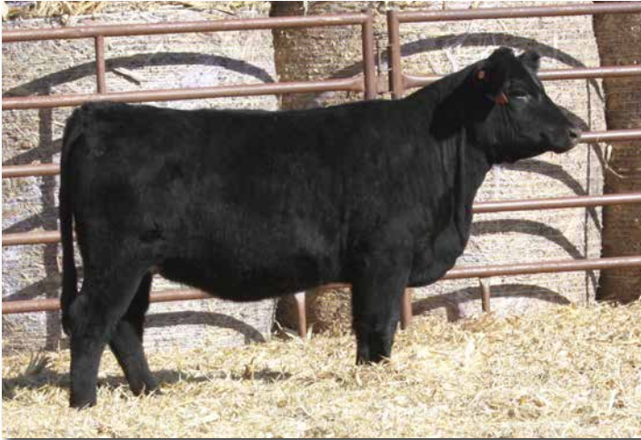
ADV MS TALON K2501 >> Sells as Lot 231.

AI bred 11/11/2023 to C-3 Next Up NS B220 J939 (4038066). PE 11/20-Present to KM CLARIFIED 214 (4263232, AAA 20322913). K2505 is a direct daughter of Brown Ms. Quanah 505B. This mating has produced some sought after bull calves in the RAB Bull Sale the past couple years. Here is a heifer ranking in the top 10% of the breed for both API and TI.