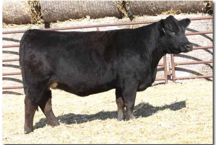
ADV MS GENESIS J1039 >> Sells as Lot 2.

Homozygous Black Cow ASA #3911787 Homozygous Polled J1039 PB SM BD: 3/15/2021