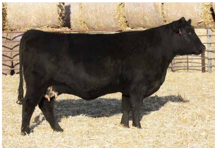
ADV MS EAGLE H0507 >> Sells as Lot 182.