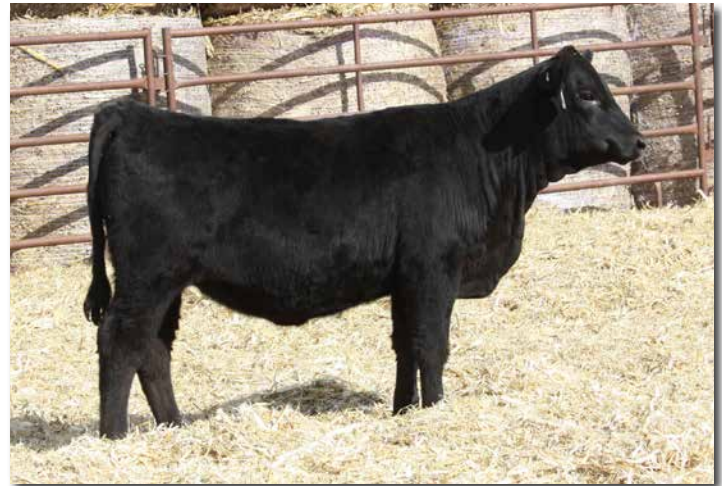
ADV MS TALON L3007 >> Sells as Lot 130.

The JC Talon sired calves have really impressed us with their consistent heifer calving ease, yet L3007 is a perfect example of the elite type and kind that you get. Talon is a shorter gestation herd sire and has lead to the confidence we have for his use in heifer projects of any size.