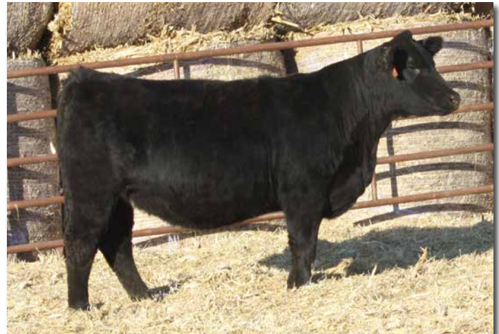
ADV MS HOMELAND K2023 >> Sells as Lot 33.

Homozygous Black Cow ASA #4096218 Homozygous Polled K2023 5/8 SM 3/8 AN BD: 3/6/2022