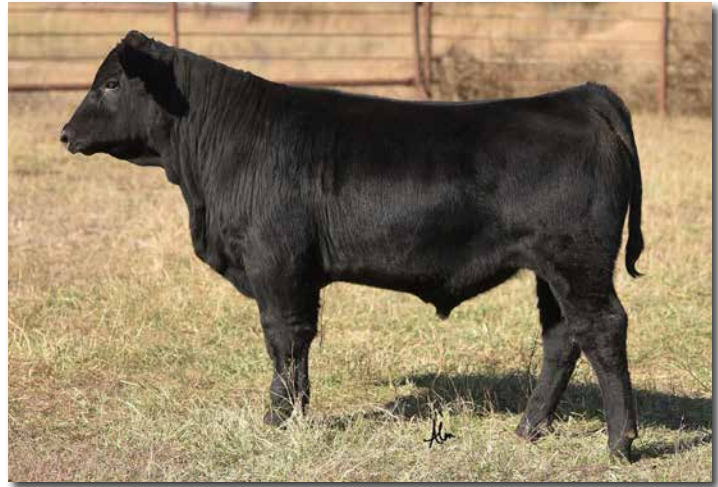
L4792 >> 2023 son of Lot 9 by JC MR Talon 403G.

Homozygous Black Cow ASA #3911805 Homozygous Polled J1007 1/2 SM 1/2 AN BD: 2/19/2021