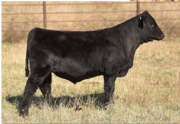
L4799 >> 2023 son of Lot 19 by Hook's Galileo 210G with a $API of 198 and $TI of 103.