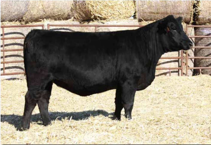
ADV MS TALON K2007 >> Sells as Lot 36.

This JC Talon ranks in the top 5% for API and is bred to Galileo. Check out the value of this planned mating and we know it works.