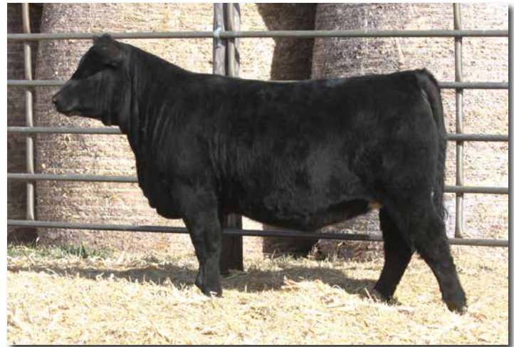
ADV MS TALON L3006 >> Sells as Lot 129.

This heifer is a truck and one that I would love to see the first few bull calves out of. Top 3% for API and top 5% for TI.