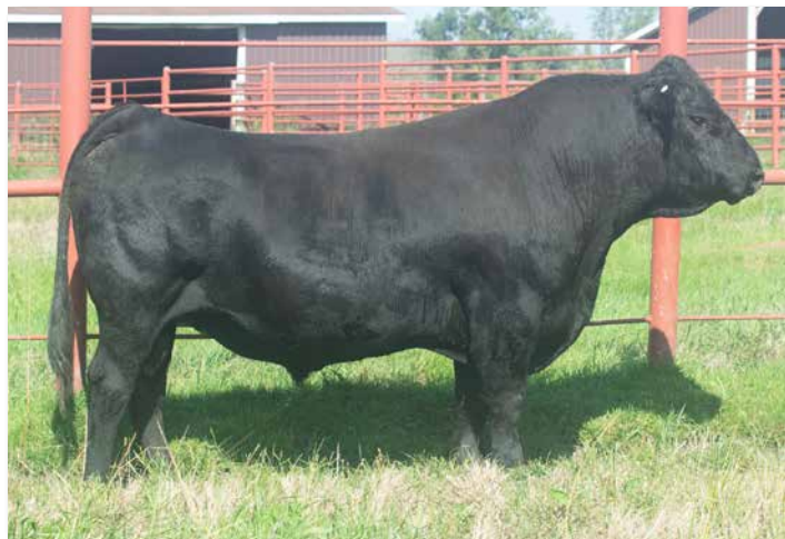
JC MR TALON 403G >> Sire of Lots 170A, 171A, 172, 173.