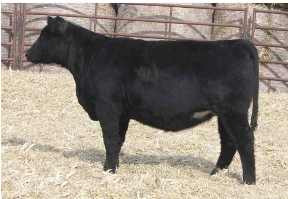
ADV MS GALILEO L3002 >> Sells as Lot 119.