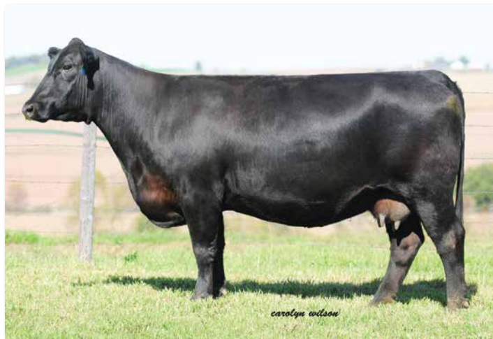
TRPH MS CATALYST A384 >> Dam of Lot 92.