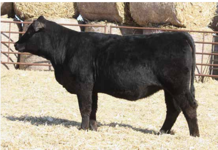
ADV MS TALON K2525 >> Sells as Lot 232.

AI bred 11/11/2023 to C-3 Next Up NS B220 J939 (4038066). PE 11/20-Present to KM CLARIFIED 214 (4263232, AAA 20322913). Another elite fall heifer calf sired by JC Talon. She ranks in the top 3% of the breed for API. By now you know how valuable we believe these Talon sired cattle are. The mating to 3-C Next Up could be special.