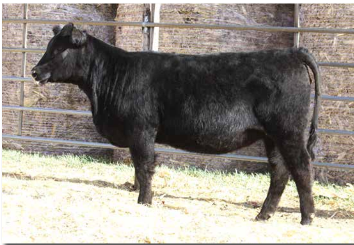
ADV MS TALON K2521 >> Sells as Lot 156.