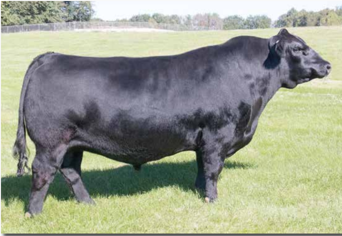
TJ GOLD 274G >> Sire of Lot 165.