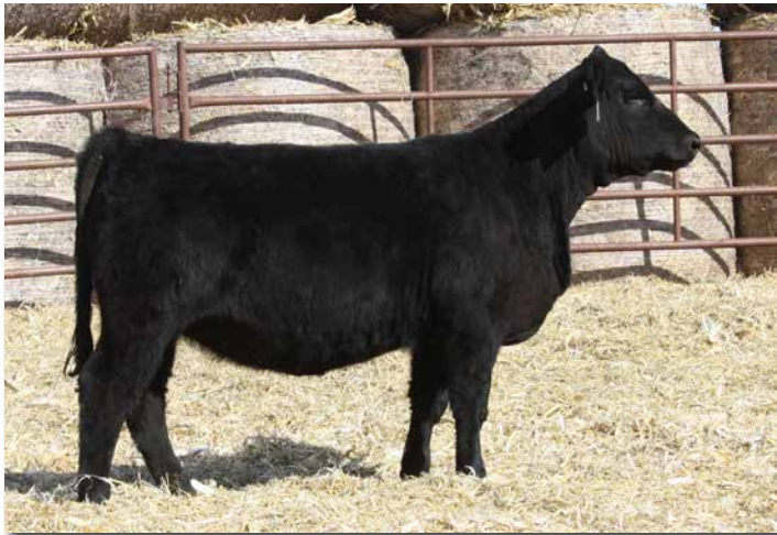
ADV MS GALILEO L3009 >> Sells as Lot 125.