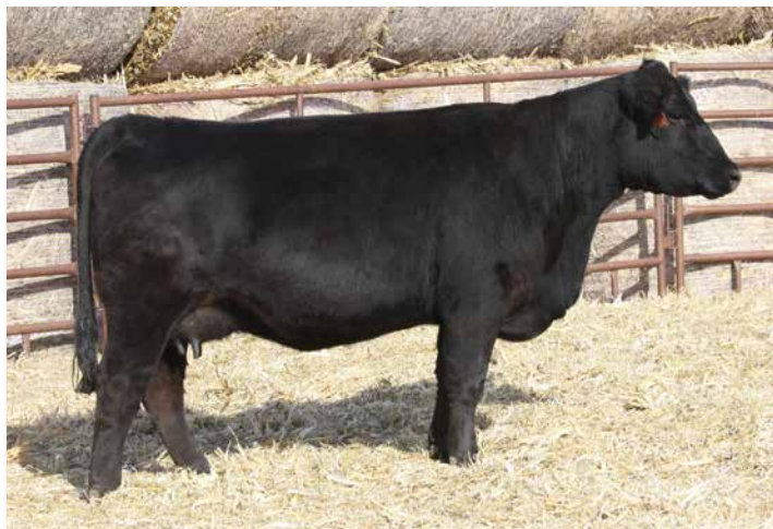
ADV MS TALON J1504 >> Sells as Lot 172.