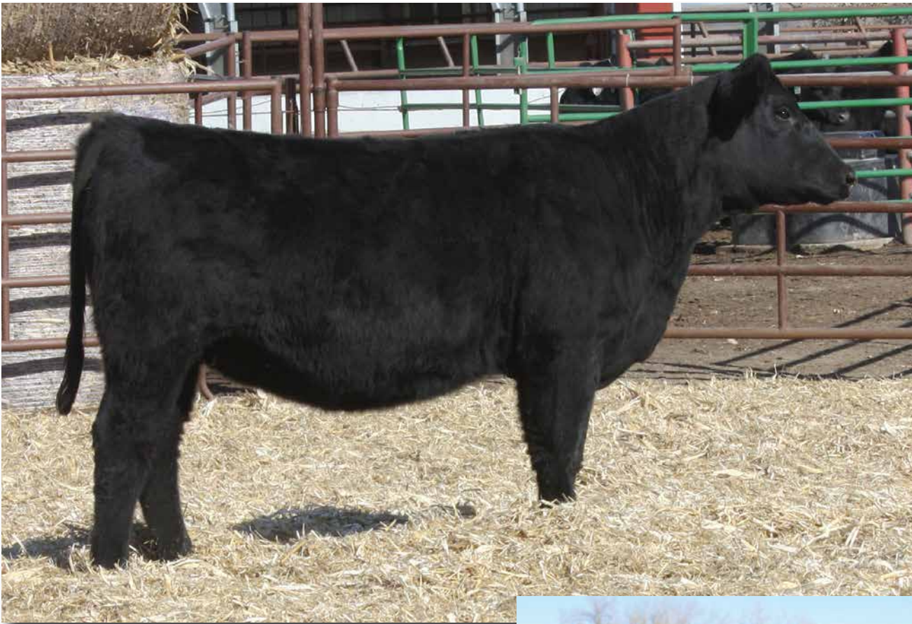
ADV MS EAGLE K2507 >> Sells as Lot 224.