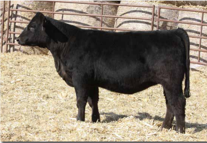
L3010 >> Daughter of Lot 99. Sells as Lot 127.