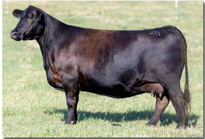
BROWN MS QUANAH 505B >> Dam of Lots 52, 53.

Homozygous Black Cow ASA #4096201 Homozygous Polled K2028 1/2 SM 1/2 AN BD: 3/8/2022