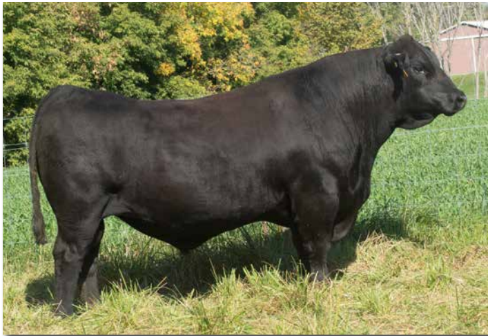
JC MR HURON 7262G >> Sire of Lot 234.

AI bred 11/11/2023 to C-3 Next Up NS B220 J939 (4038066). PE 11/20-Present to KM CLARIFIED 214 (4263232, AAA 20322913).