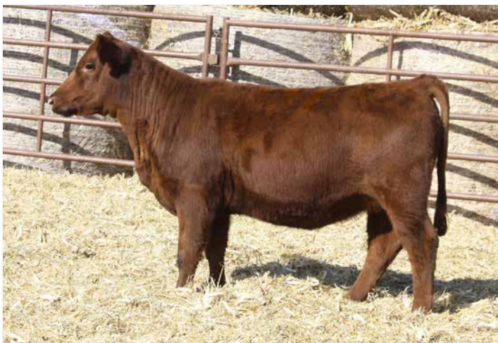
ADV MS HILGER ONE L3030 >> Sells as Lot 144.

Sells open. One of the very youngest heifers, everybody needs to have Admiral influence in their herd. L3044 traces back to the TJ 8T cow.