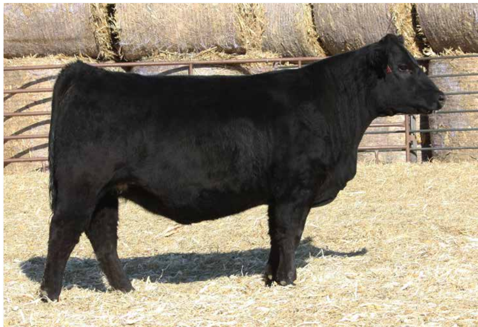
ADV MS HOMELAND K2037 >> Sells as Lot 30.

I am so excited to hear the outcome of these matings of high quality Homeland daughters to CLRS Inspired. Inspired hit us really hard this past year at Clear Springs bull sale. We had plenty of room to utilize a unique Beacon son and we believe Inspired could be one of Beacon's best sons.