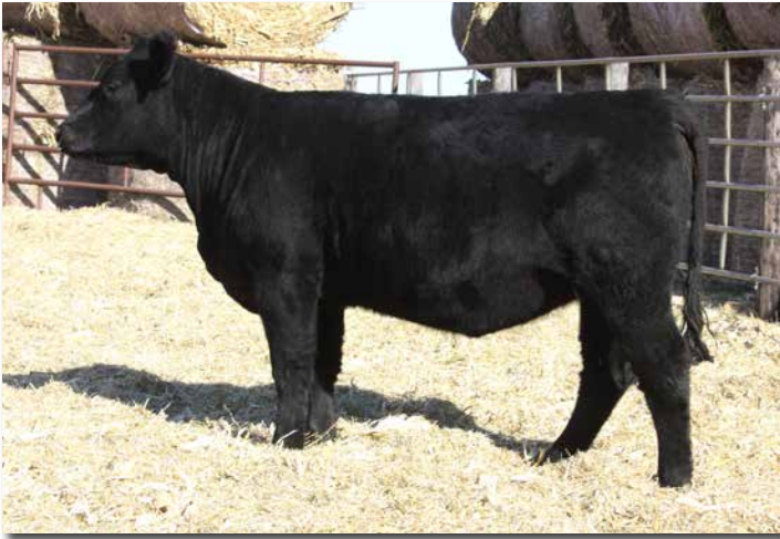
ADV MS EAGLE K2505 >> Sells as Lot 230.