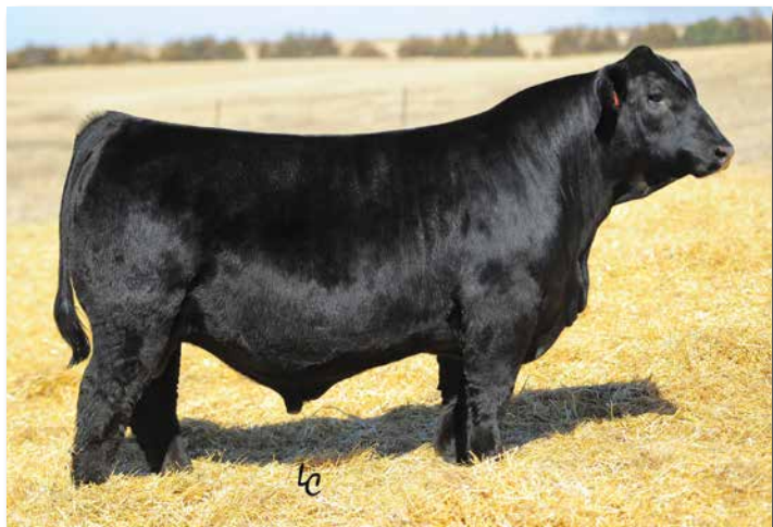
CCR WIDE RANGE 9005A >> Sire of Lots 91, 92.